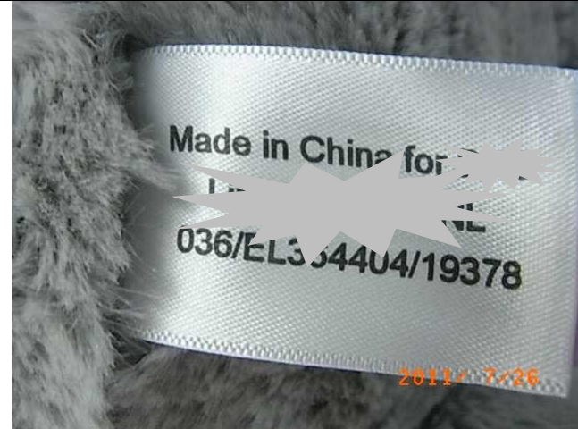
Front side of sewn-in label of Elephant