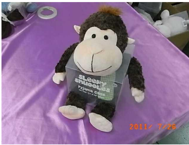
Retail package for monkey