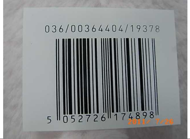
Barcode of Rabbit