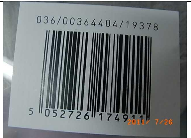
Barcode of Elephant