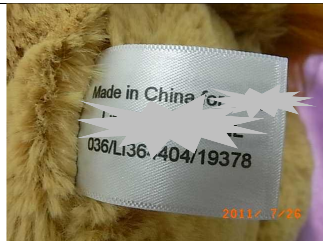
Front side of sewn-in label of Lion