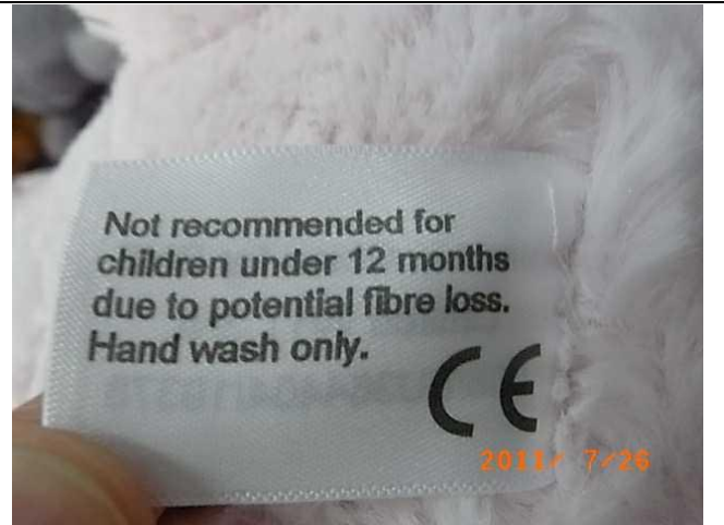
Back side of sewn-in label of Rabbit