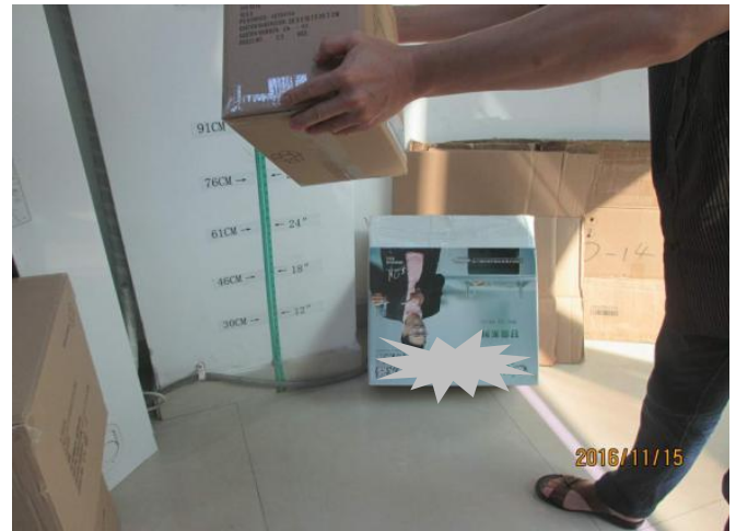
Carton drop test