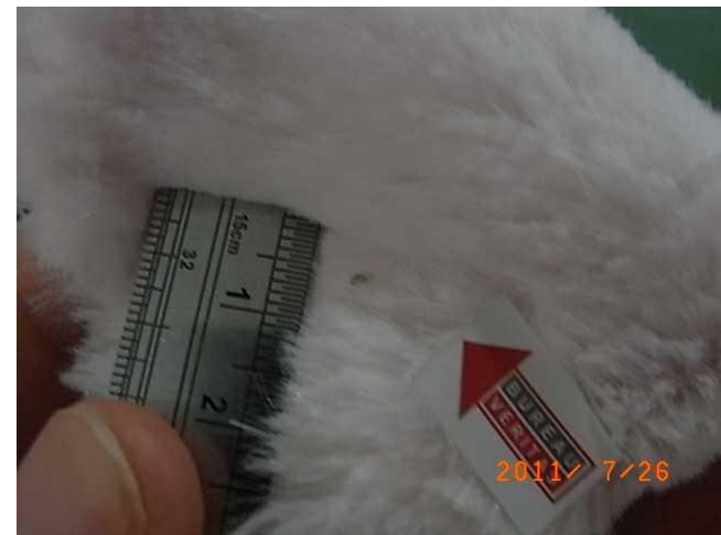
Dirty mark 0.3cm on surface