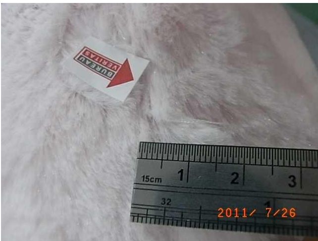
Untrimmed thread ends 2-5cm on product