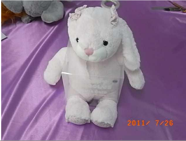
retail package for Rabbit