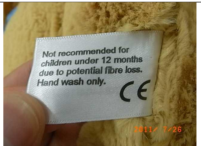
Back side of sewn-in label of Lion