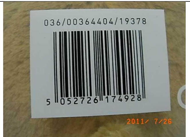
Barcode of Lion