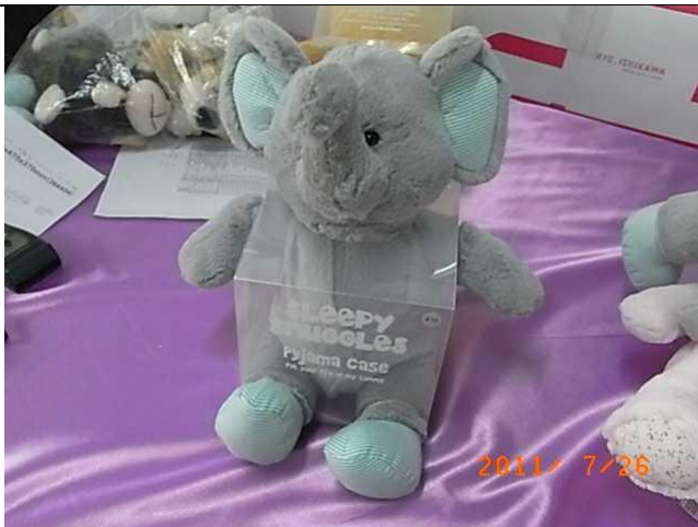
retail package for Elephant