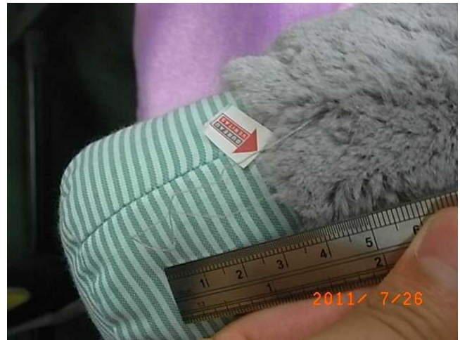
Untrimmed thread ends 2-5cm on product