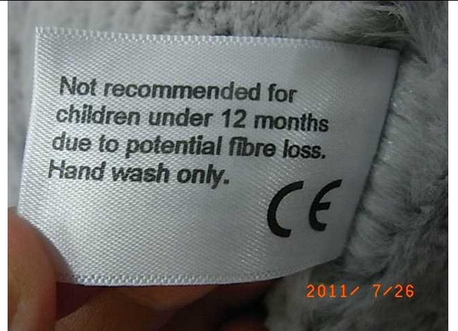
Back side of sewn-in label of Elephant