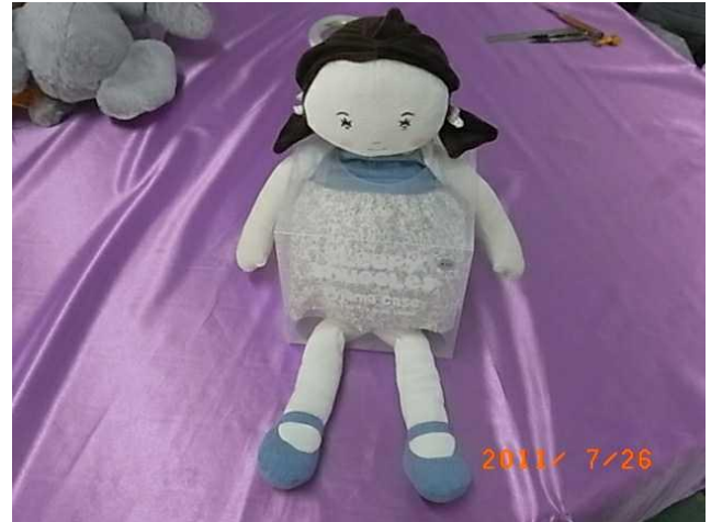
Retail package for Rag doll