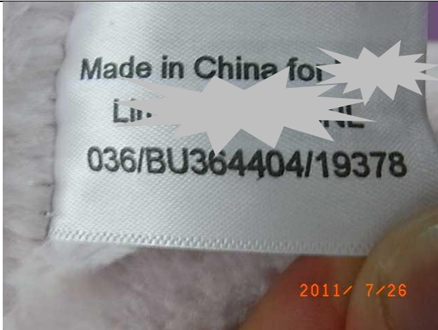
Front side of sewn-in label of Rabbit