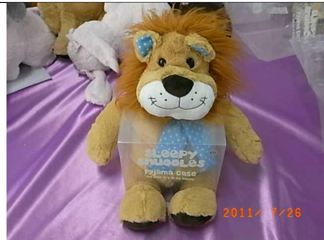
retail package for Lion