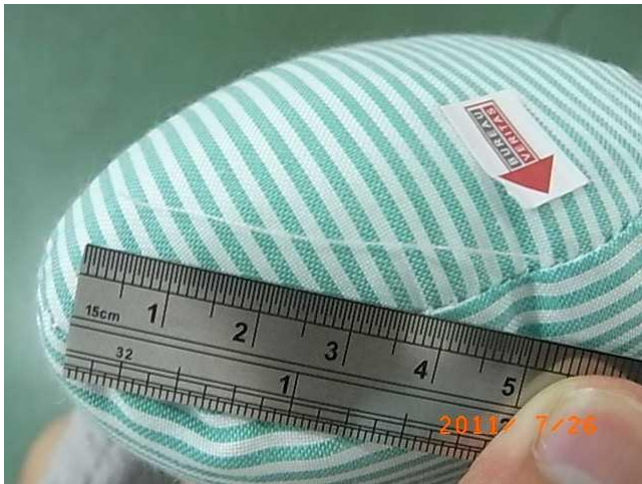
Untrimmed thread ends 2-5cm on product