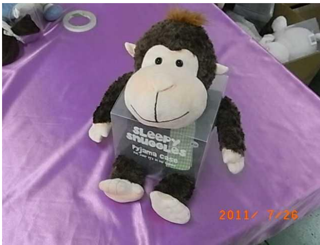
Retail package for monkey